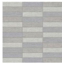
Cool Blend Stacked Mosaic