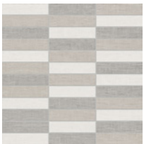
Warm Blend Stacked Mosaic