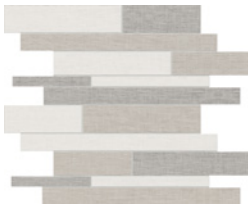
Warm Blend Linear Mosaic